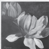
Moonlit, oil by Janice Evans

All work for sale, show runs until Saturday, September 29.