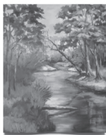
Bayou Manchac Before the Flood, 30x24 Acrylic by Kay Lusk

All work for sale, show runs until Saturday, September 30. In conjunction with Mid City Merchants' A Mid City Night's Dream