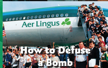
How to Defuse a Bomb