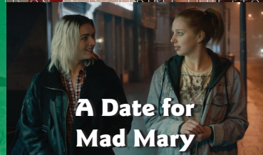
A Date for Mad Mary