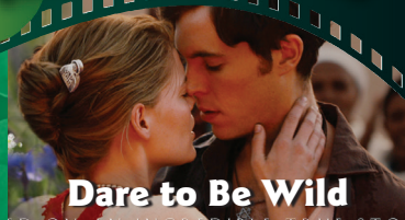
Dare to Be Wild

Friday, July 28 and Saturday, July 29, 2017 Manship Theatre Baton Rouge, Louisiana